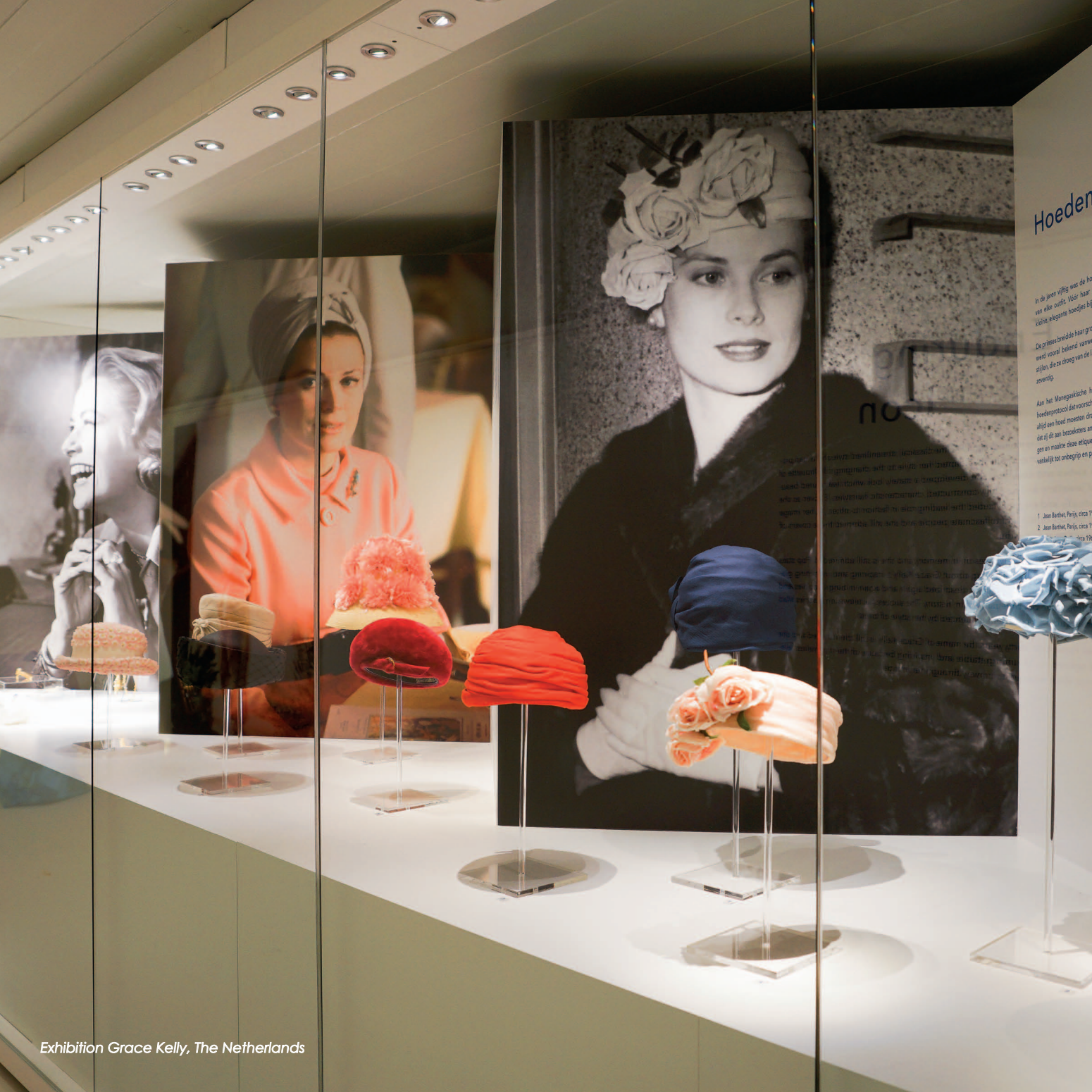
Exhibition Grace Kelly, The Netherlands