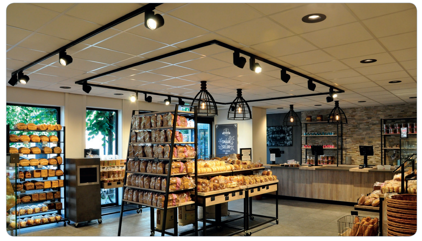
Bakery Geert Vonk, The Netherlands